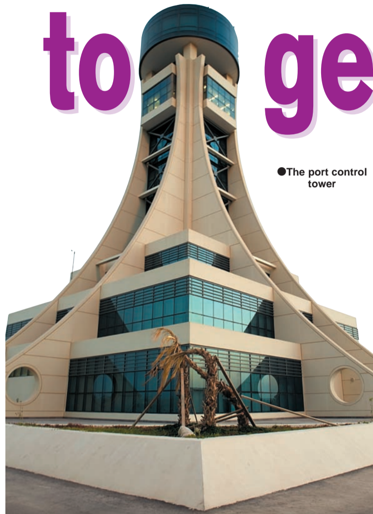
●The port control tower