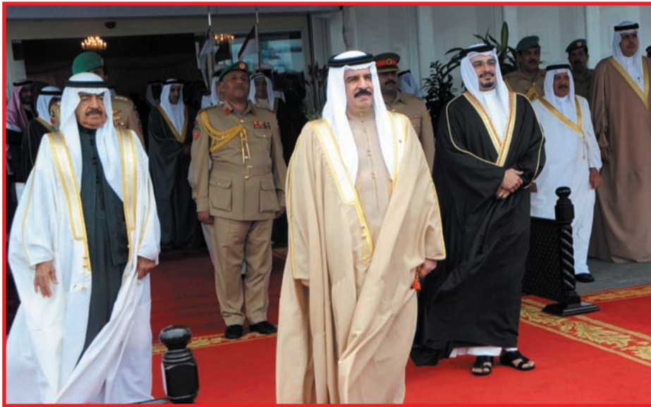
●The King, the Premier and the Crown Prince at the opening ceremony