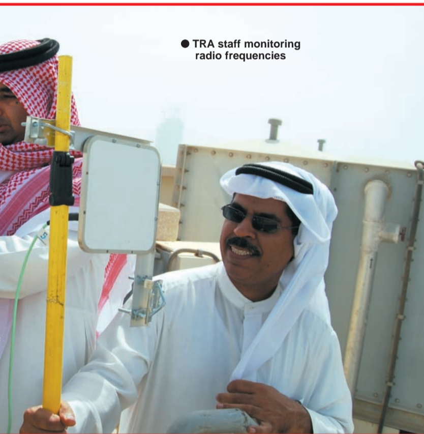
● TRA staff monitoring radio frequencies

cable landing station, hosted within Batelco's property.