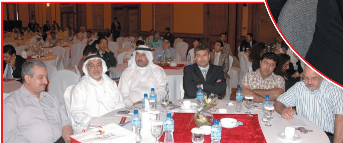
● Delegates at the growth conference

MASSIVE investment is being pumped into supporting small businesses, coupled with a masterplan to put 185,000 Bahrainis into jobs over the next five years.