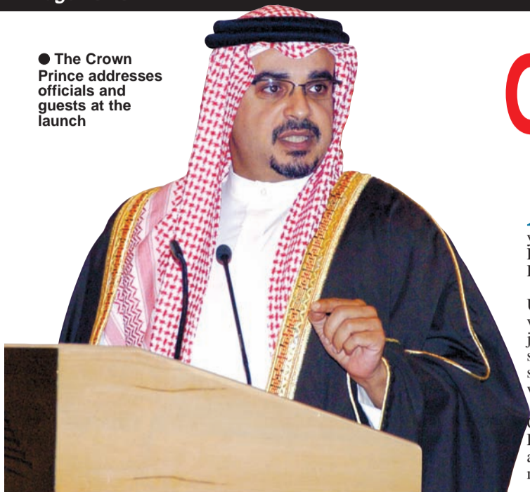
● The Crown Prince addresses officials and guests at the launch